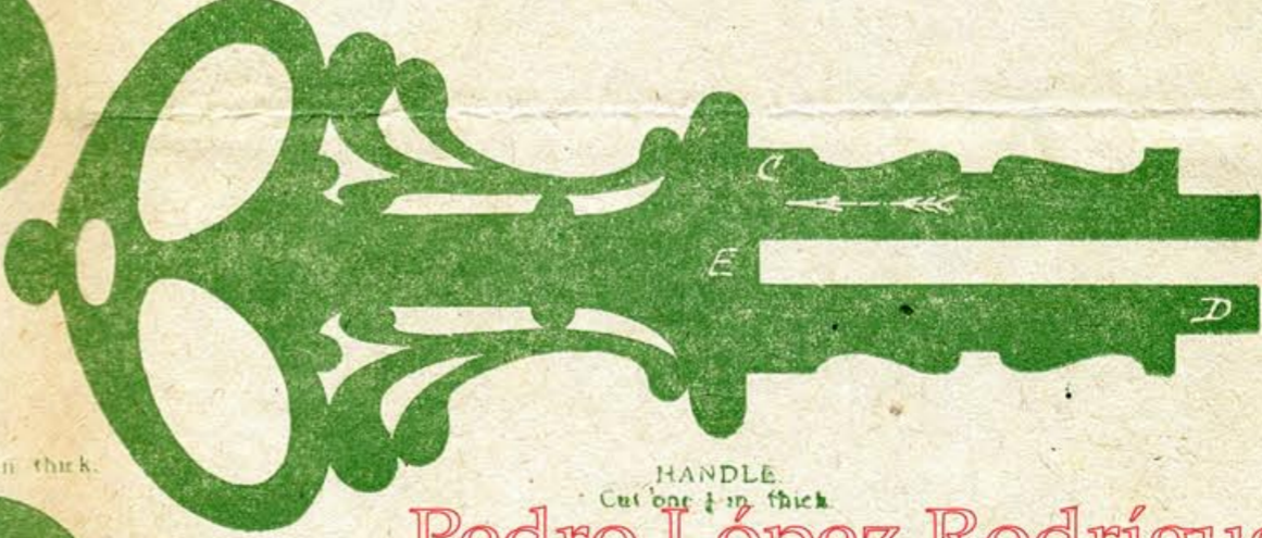
HANDLE. Cut one 1/4 in. thick.