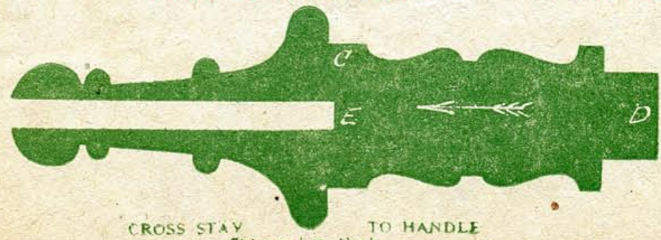
CROSS STAY TO HANDLE Cut one 1/4 in. thick.

Pedro López Rodríguez 2006 www.finescrollsaw.com