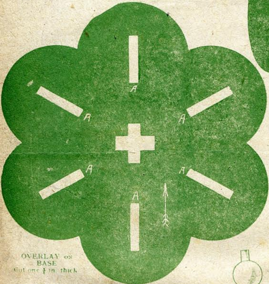
OVERLAY ON BASE Cut one 1/4 in. thick.