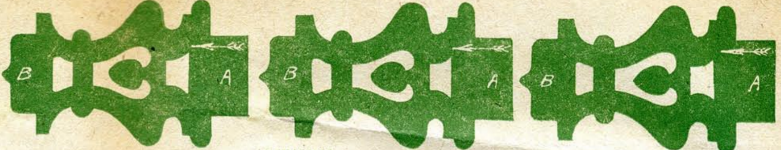
UPRIGHTS. Cut one of each 1/4 in. thick.