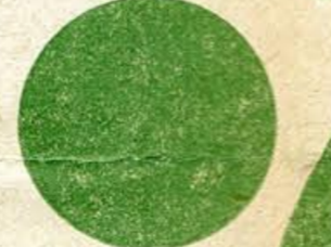
FEET Cut one of each 1/4 in. thick.