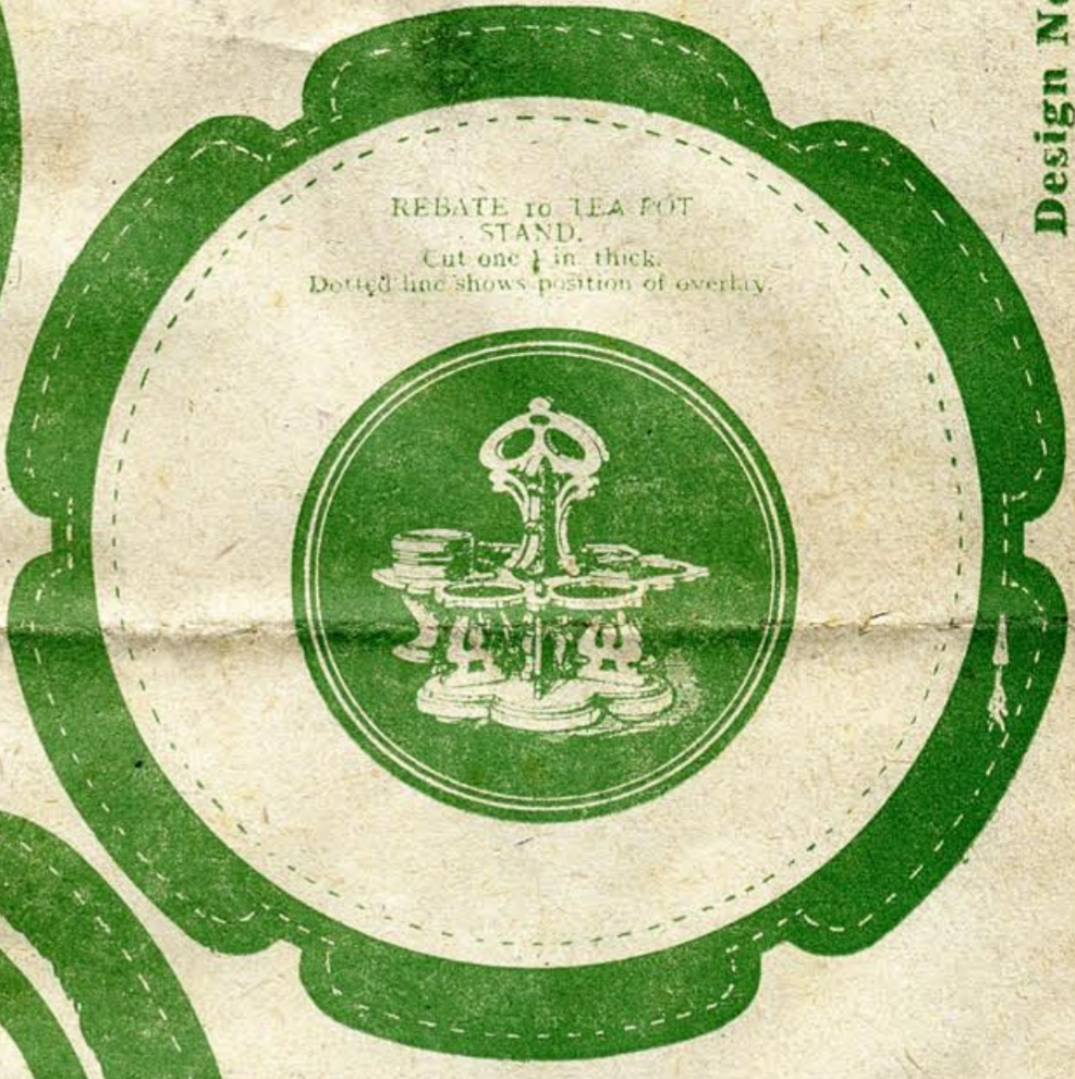
REBATE to TEA POT STAND. Cut one 1/4 in. thick. Dotted line shows position of overlay.