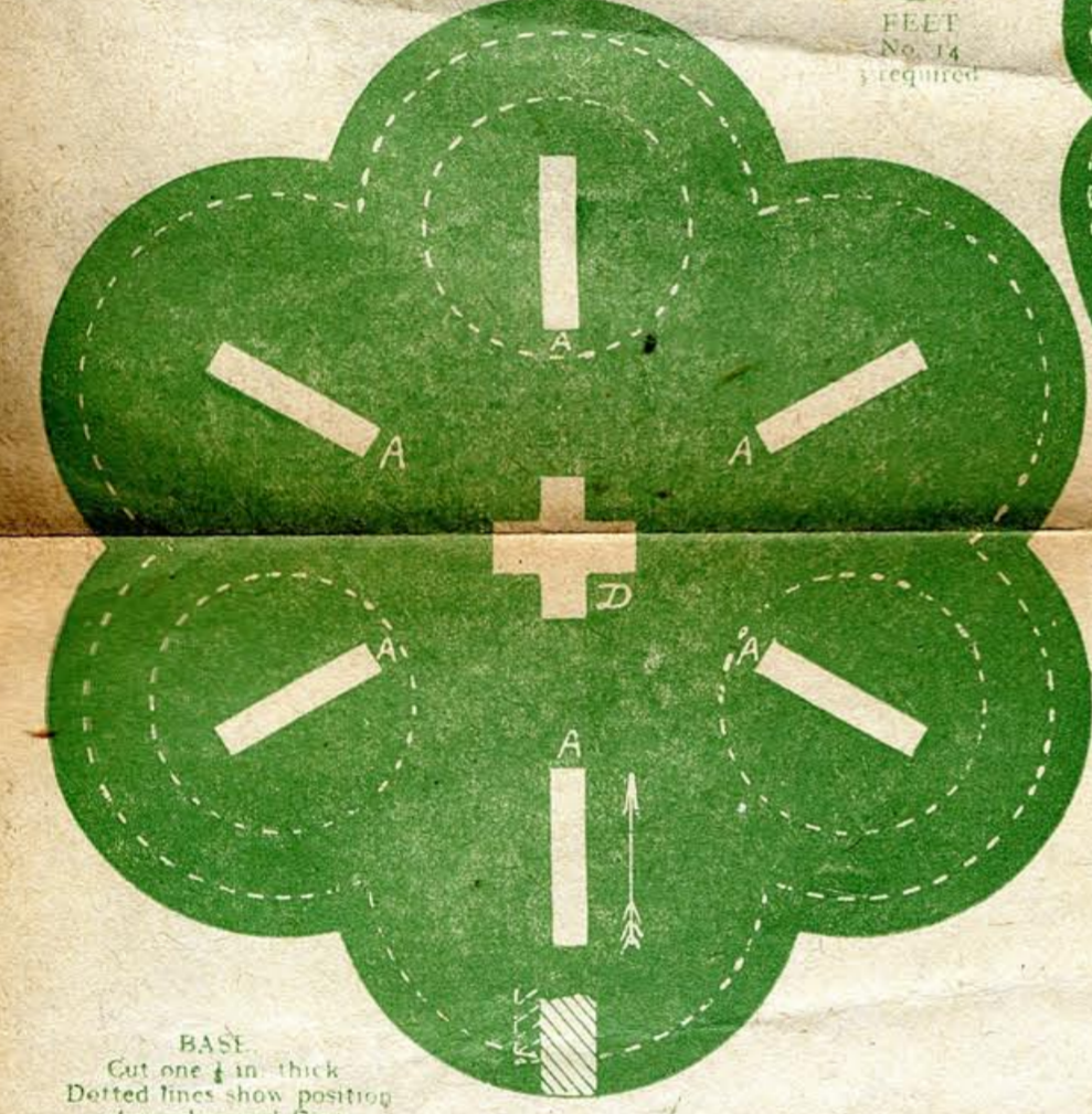
BASE. Cut one 1/4 in. thick. Dotted lines show position of overlay and feet.