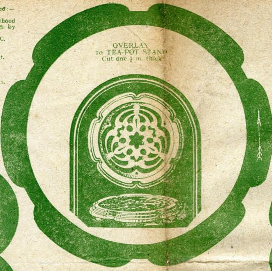
OVERLAY to TEA-POT STAND Cut one 1/4 in. thick.