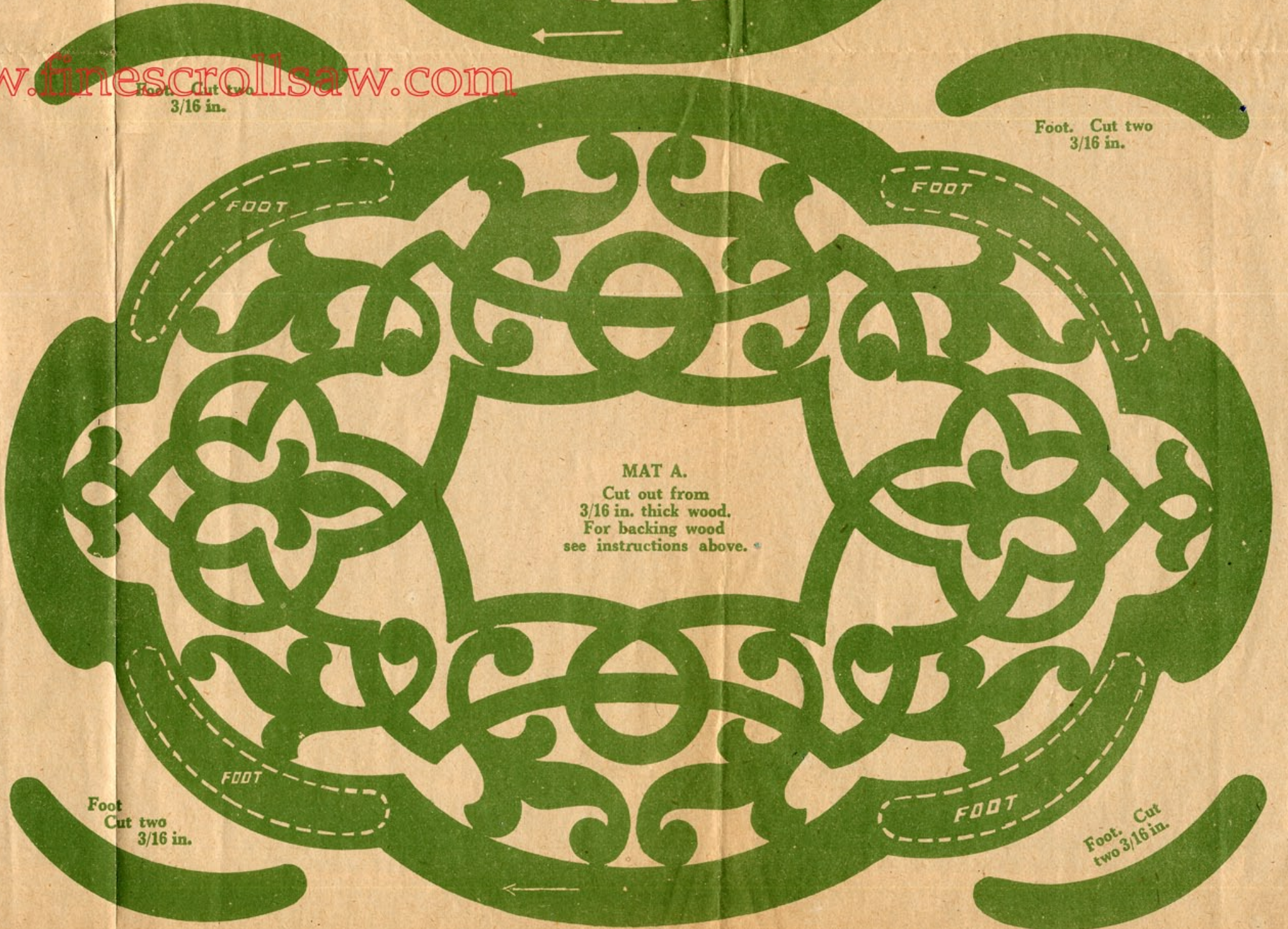
MAT A. Cut out from 3/16 in. thick wood. For backing wood see instructions above.